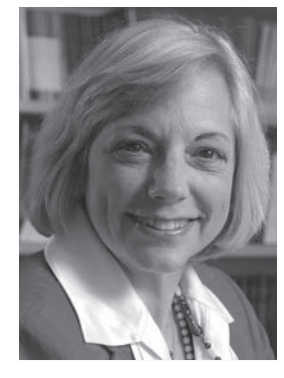
AERA Presidential Address Followed by Champagne Reception #AERAPres

Aligned Ambitions: What's Behind the College Mismatch Problem?